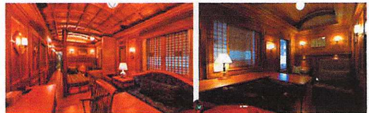
Deluxe Suite A